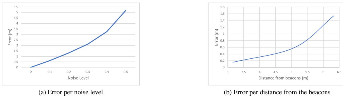
Figure 2: Localization error.

In order to evaluate our approach in more real-like conditions, noise was gradually introduced into the experiment. In total the process described above was repeated 5 times with 5 different noise levels: 10%, 20%, 30%, 40% and 50%. Noise strength is the standard deviation of the Gaussian noise added to the signal strength. The rest of the conditions were controlled (i.e. the random seed) making sure the experiment would be the same, providing comparable results. As seen in Fig. 2a, for 10% noise the error was 0.6m while for 20% noise the calculated position was 1.4m off. Further increasing the noise had a bigger impact.