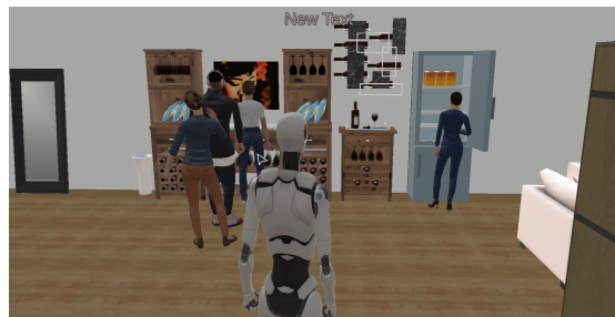
Figure 3: In-game screenshot of the Extraversion Room.

For the Extraversion Escape Room, the aim is to gather metrics regarding the player’s sociability and assertiveness. So, we implemented non-player characters (NPC) to fulfill the roles of party guests, since at this point of the story a big party to which the player has been invited is happening, as we can see in Figure 3. In this scenario, the player wishes to have another drink before leaving the party which is thought to be available at the bar. However, there is a queue in front of him. One can choose to overpass the people waiting and get to the bar without caring about appearing rude, as seen in Figure 3. The second option is to stay behind the others and patiently wait until those who precede finish. Aside from the drinks found at the bar, there is a locked drawer in the office with a bottle inside that can be accessed only by interacting with the host, who is an NPC, and asking for the key.