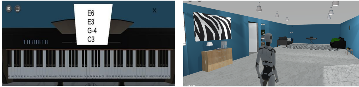
Figure 1: In-game screenshot of the music sheet placed on the piano and the room.

If we examine the example displayed in Figure 1, then E6, E3, G-4, and C3 piano keys must be pressed in that exact order so as to be considered correct. Contrariwise, the player needs to play the piano again from the start. In Table 1 we can observe the most important measurements taken, as well as the outcome behaviours in this ER.