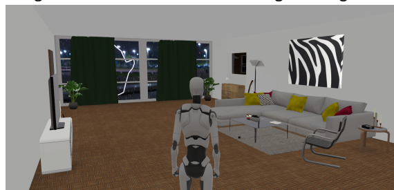
Figure 4: In-game screenshot of the Neuroticism room.

The Escape Room measuring Neuroticism is implemented in a way to elicit panic, with the scope of collecting data regarding the player's attitude in stressful situations. Neuroticism is manifested through one's emotional stability and calmness. For that reason, the story for this ER is an ongoing storm loud enough to frighten the player. A thunder strikes the oven igniting a fire, while the storm causes a power cut and turns the lights off. To simulate a storm, effects including loud rain sounds and intense light changes are utilised.